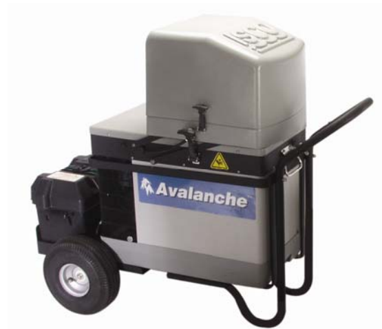
Optional mobility kit includes pneumatic tires for ease of transport over rough terrain, and a convenient battery platform.